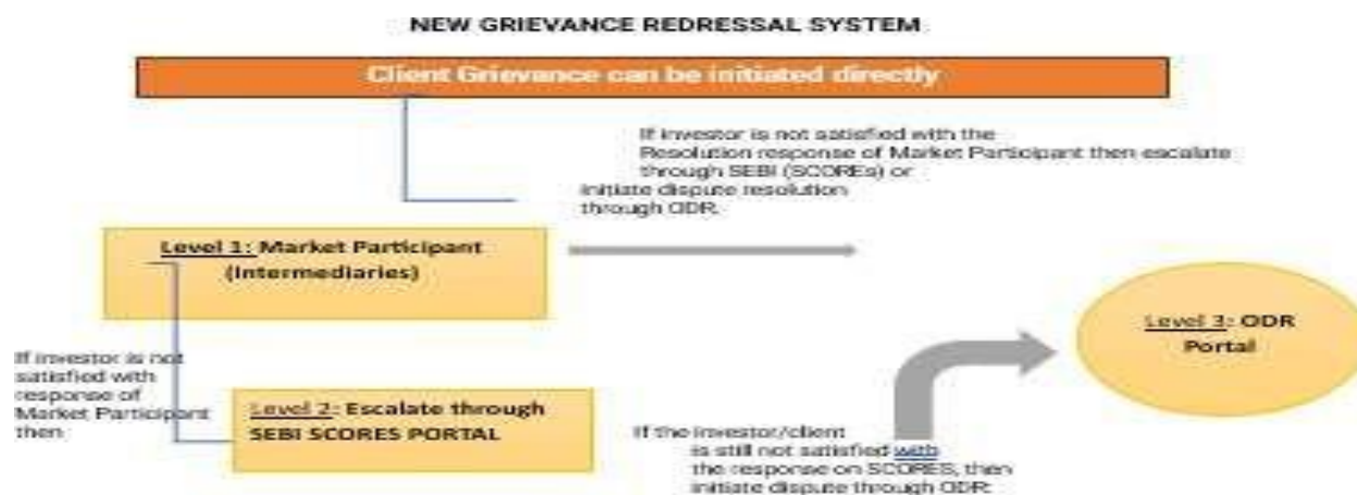
Illustration of New Grievance Redressal System 10